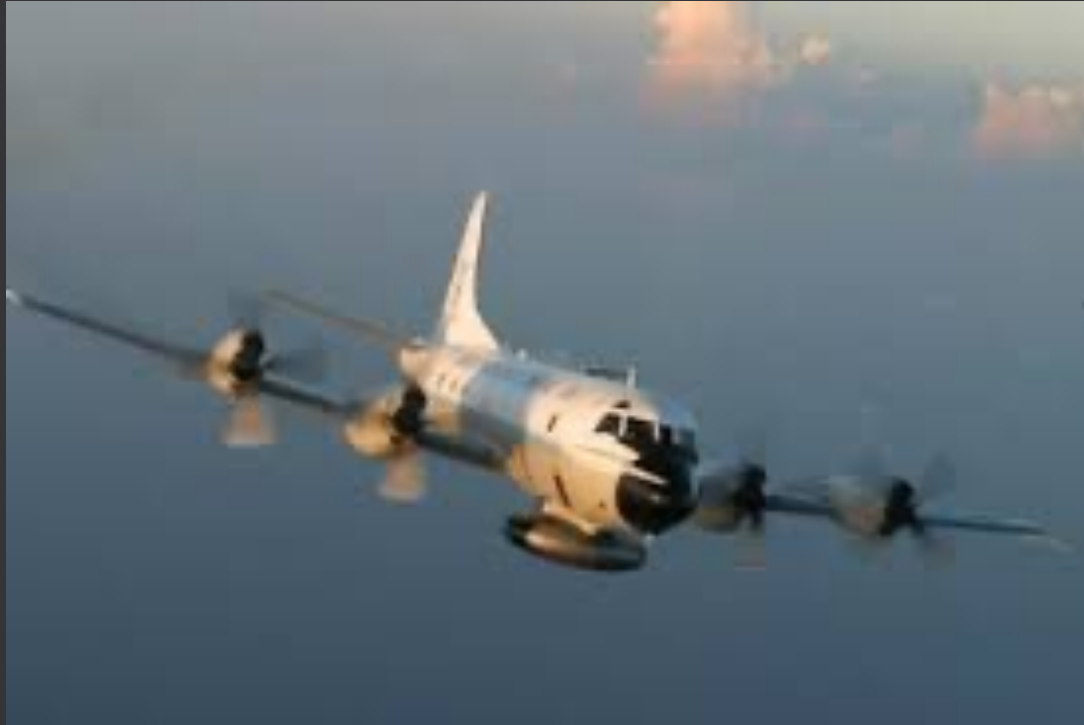
The plane used by the “Hurricane Hunters”