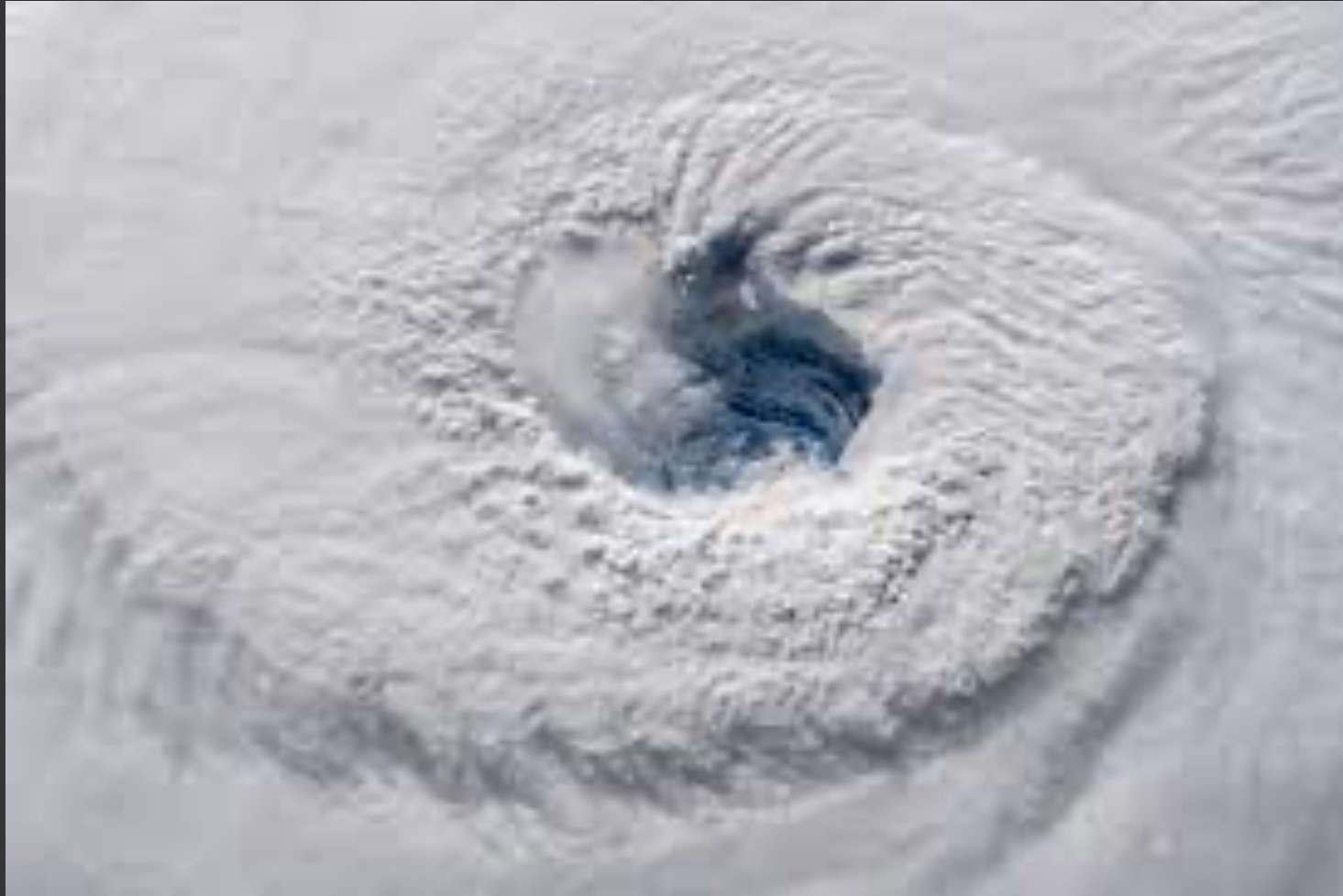
An aerial view of a hurricane